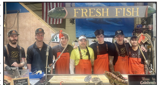
Members of the Team

In the end, Penn Avenue Fish Company stands out as more than just a restaurant. It reflects Pittsburgh's culinary diversity. By combining the roles of market and eatery, it delivers fresh seafood in a way that feels both modern and welcoming, securing its place as a go-to destination for seafood lovers in the Steel City.