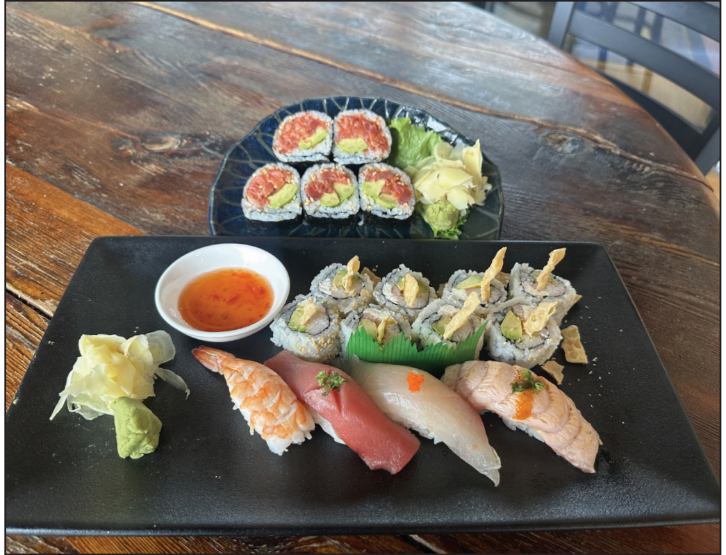
Sushi Plater with Nigiri & Sushi Rolls

The menu is where Penn Avenue Fish Company truly shines. Diners can choose from a wide variety of options, ranging from simple sandwiches to more refined dishes. Popular items include grilled salmon sandwiches, crab melts, and fish tacos, each built to let the quality of the ingredients speak for itself. The sushi selection adds another layer of variety, offering rolls and sashimi that rival those of